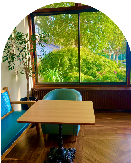
An example of the principles of biophilic design in action in the hospital, bringing the outside in through the use of indoor plants, nature-inspired colour schemes, and imagery

Strengthening our connection with nature has been shown to boost wellbeing, reduce stress, foster positive emotions, and even inspire pro-environmental behaviour. To help people experience these benefits more deeply, researchers at the University of Derby identified five simple pathways to build stronger bonds with nature and support mental health 3 .